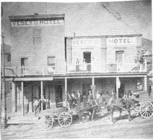
This photo at left dates from the 1860s. The wood structure on the left side of the building disappeared sometime prior to 1890; the right-hand building survived and is the core of the current Gold Hill Hotel.

Gold Hill was adjacent to the even larger industrial business center of Virginia City. The combined population of the two towns reached 15,000 in early mid-1860s, becoming one of the largest cities in the West. This was in addition to the major mining operations, which were producing headline-grabbing amounts of silver and gold. By the mid-1870s, the combined population of Virginia City and Gold Hill reached 25,000 .